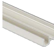
AW02 Starter Profile