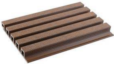
UH61 Castellation Cladding Board