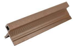
UH 51 Corner Trim