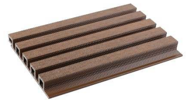
UH61 Castellatio n Cladding Board

NewTechWood Castellatio n Cladding is reminiscent of the top of a castle wall having a series of rectangular alternating parapets and indentations.