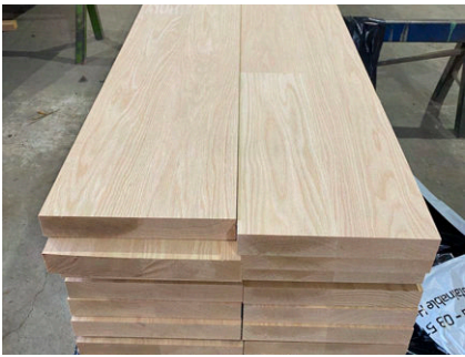
Set width in small packs