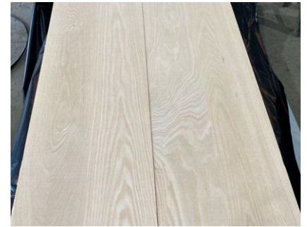
Fault docked and well graded