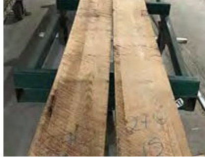
Boards with cupping and spring