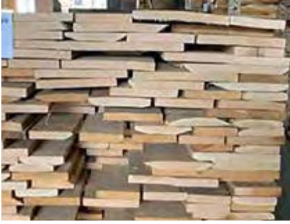
Random widths with wane, cupping, end splits and in very large packs