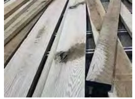
Large knots and defects mid length